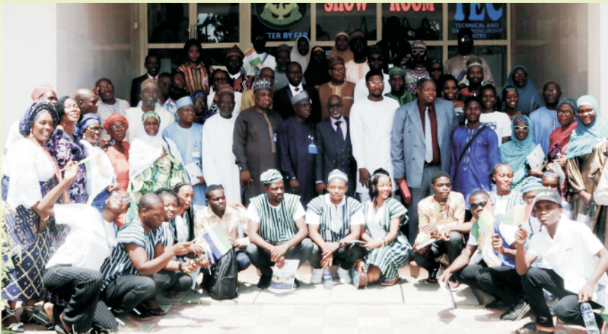
The international students with dignitaries at the event

The management of the University of Ilorin has taken proactive steps to reduce energy consumption on campus to mitigate the financial impact of rising electricity tariffs on its budget.