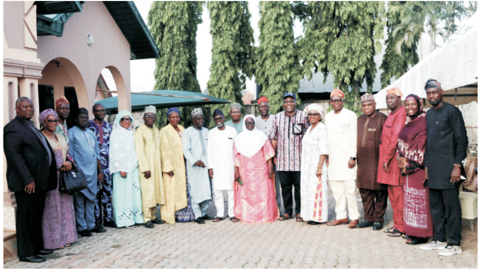
■ The Vice Chancellor and his wife (middle) receiving the visitors in his house