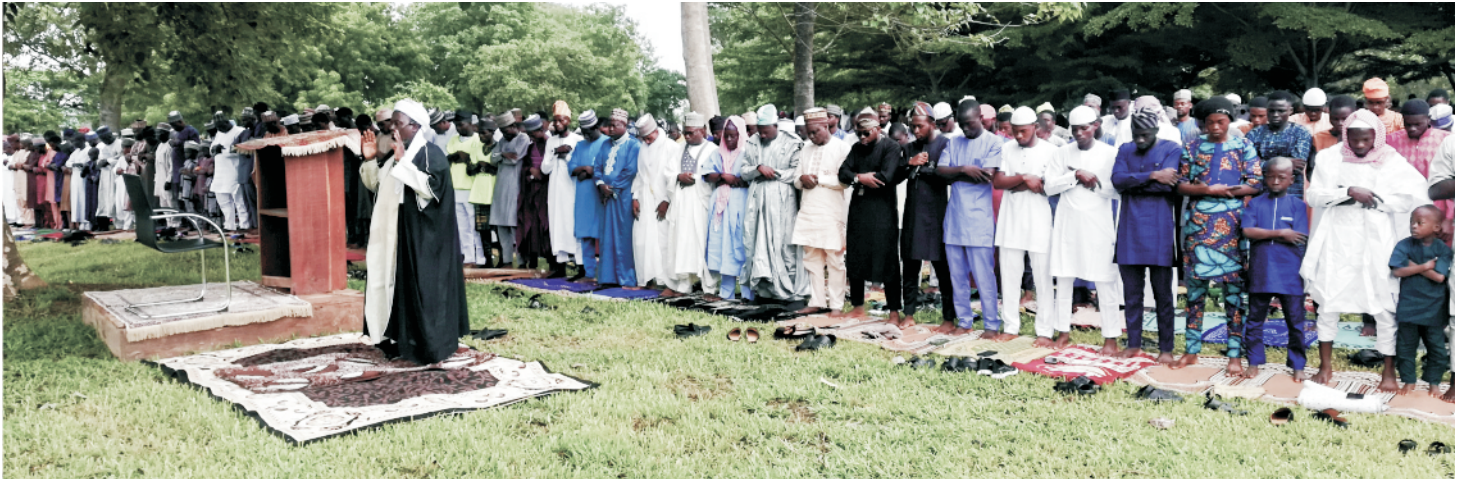
■ The Chief Imam leading the Eid-ul Adha prayers