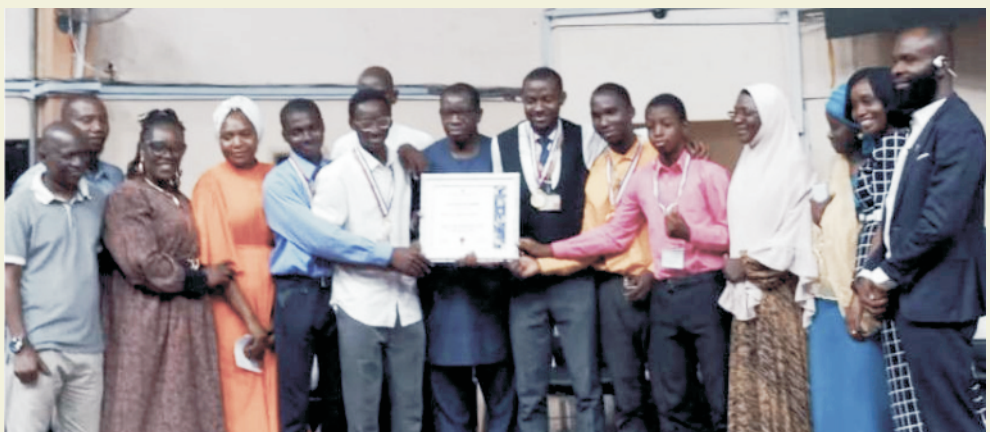
■ Members of the Pharmaceutical Sciences Public Speaking Team receiving their certificate from the Dean, Student Affairs (middle)