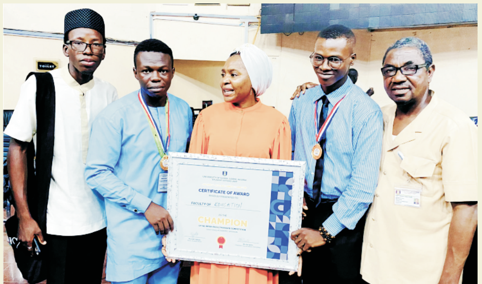
■ Members of the Faculty of Education Debate Team receiving their certificate