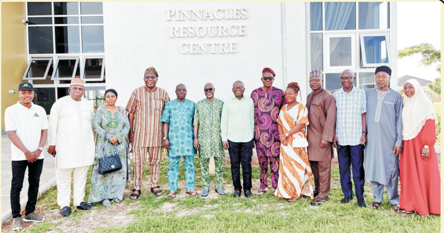
PINNACLES RESOURCE CENTRE