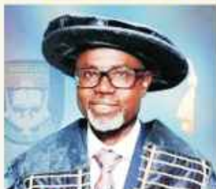
■ Prof. Egbewole

the distribution and installation of the allocated equipment for the various Faculties and Departments commenced last Wednesday (July 17, 2024).