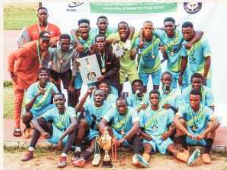
■ Players of Faculty of Education celebrate their victory