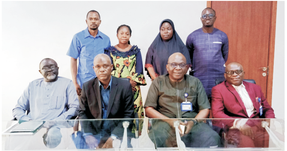
■ NMEP team and principal officers of the University during the visit, last Tuesday

While pledging the University of Ilorin's support to the national effort, the Vice Chancellor said, "As a university, we will provide all the support needed to achieve a successful study. One of the things we have not been able to do as a country is to get value for money. We hope the team will do everything possible to ensure that the outcome will be worth every kobo spent on the study."