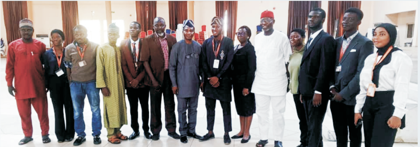
■ Cross section of members of the contest committee with the winners