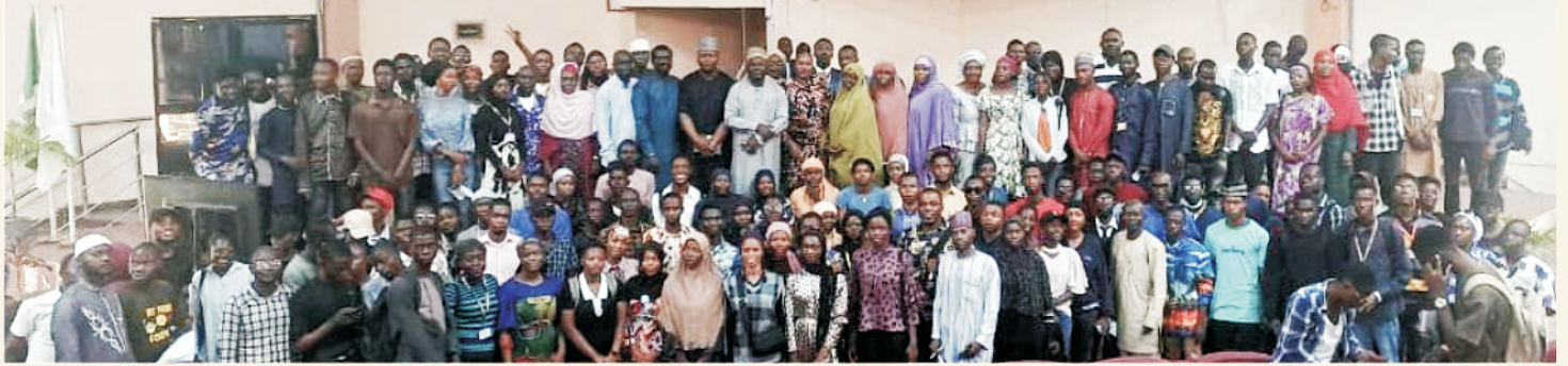
■ Cross section of the participant at the workshop