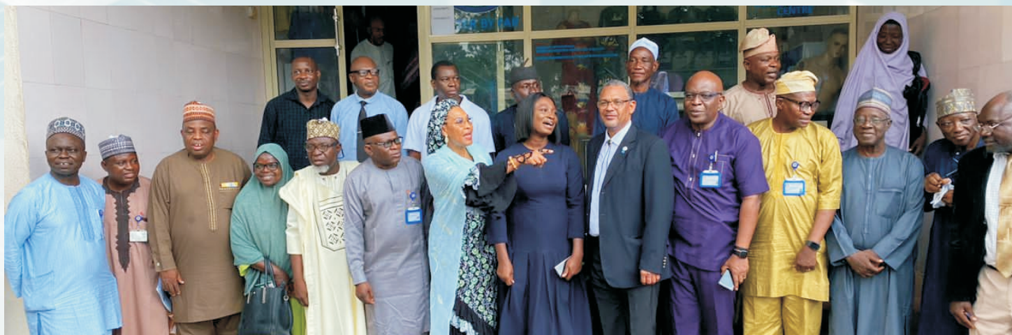
■ Participants at the first Faculty of Veterinary Medicine Annual Lecture