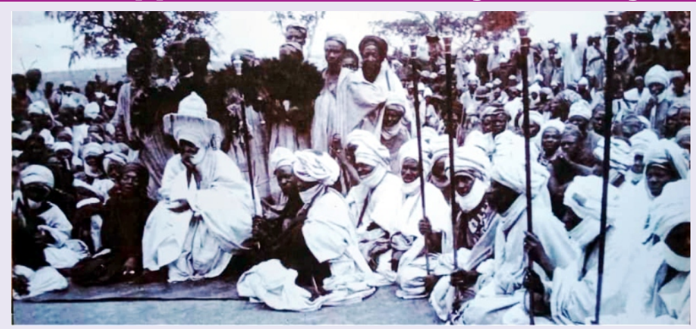
One of the donated portraits

He encouraged other individuals, organisations, and families across and beyond the Ilorin Emirate to forward