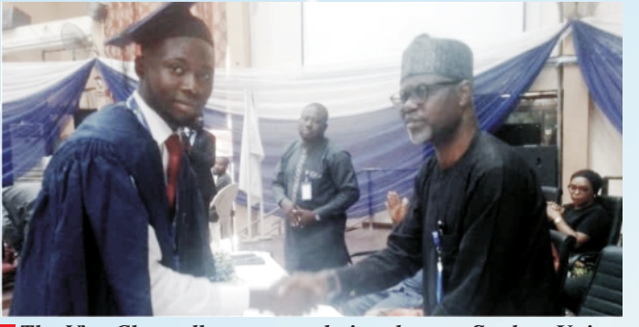
■The Vice Chancellor congratulating the new Student Union President