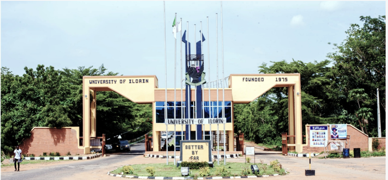
■ The new University Gate