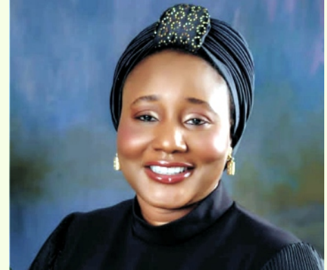
■ Justice Akanbi-Yusuf