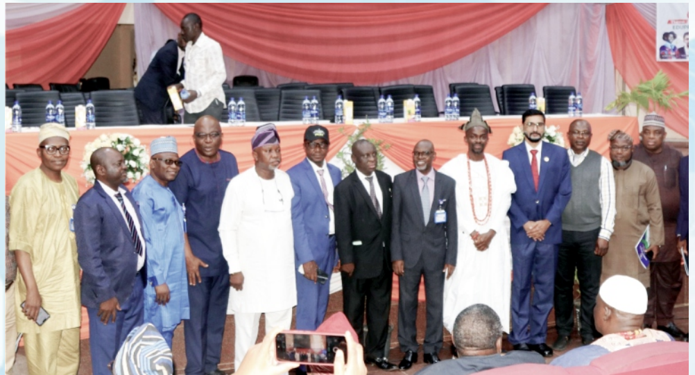
■ The Vice Chancellor (middle) and other dignitaries after the Conference last Monday

The Vice Chancellor, who described the Conference theme as not only apt but also timely and relevant, said he was optimistic that the Conference would inspire more students to willingly pursue courses in the field of Education. (Contd. on page 3)