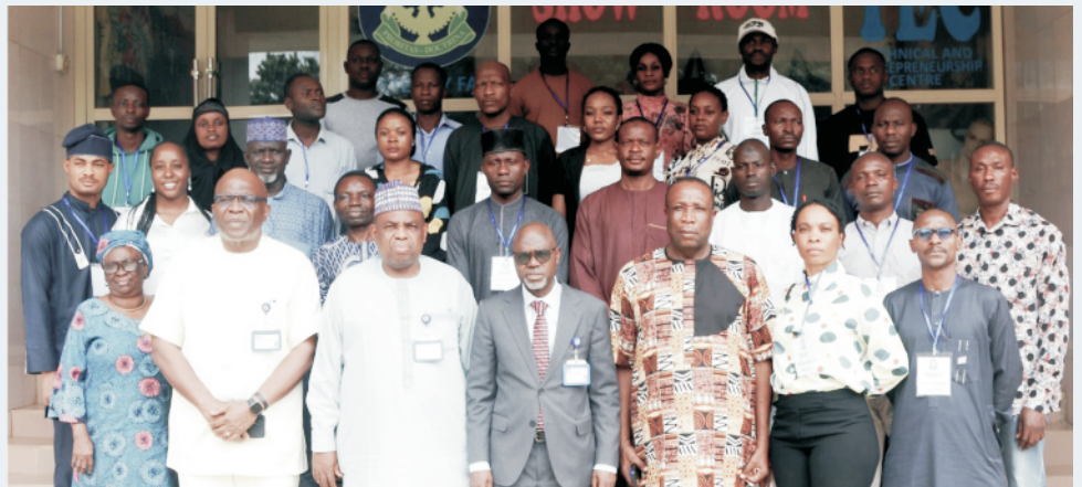
■ The NAISSET students with the Vice Chancellor and other Principal Officers after the visit