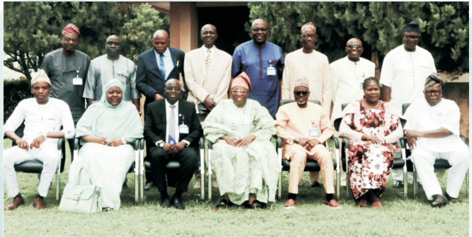
The Council members after their inaugural meeting last Monday