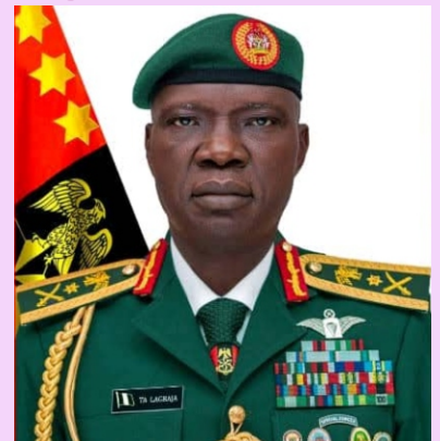
■ Lt. General Lagbaja