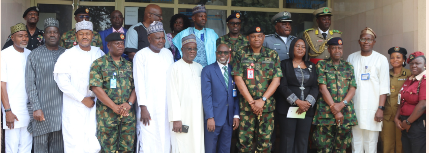
■ Dignitaries at the lecture last Tuesday