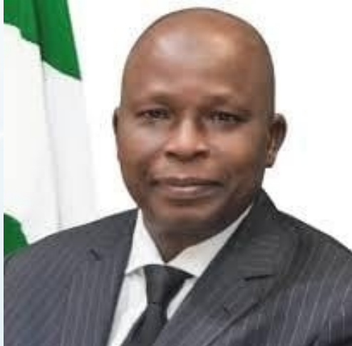
■ Prince Fagbemi

The Attorney-General of the Federation and Honourable Minister of Justice, Prince Lateef Olasunkanmi Fagbemi, SAN, will on Friday, October 18, 2024 deliver this year's Convocation Lecture of the University of Ilorin as part of the activities marking the institution's 39th Convocation Ceremonies.