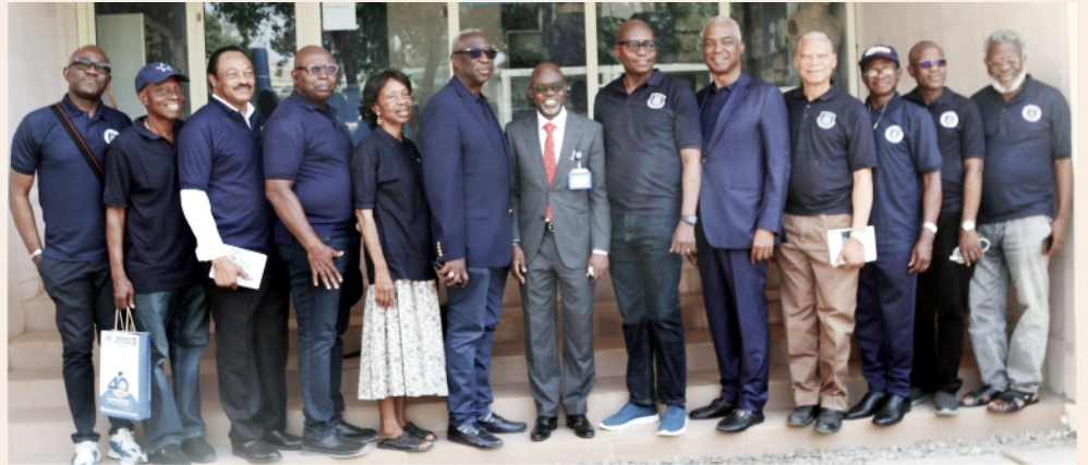
■ Some members of the 1984 Medical graduands with the Vice Chancellor during the visit

The Vice Chancellor assured them that the equipment, which is novel