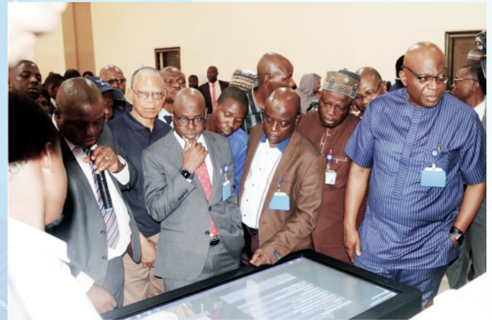
The Vice Chancellor and other members of the management receiving the Dissection Table