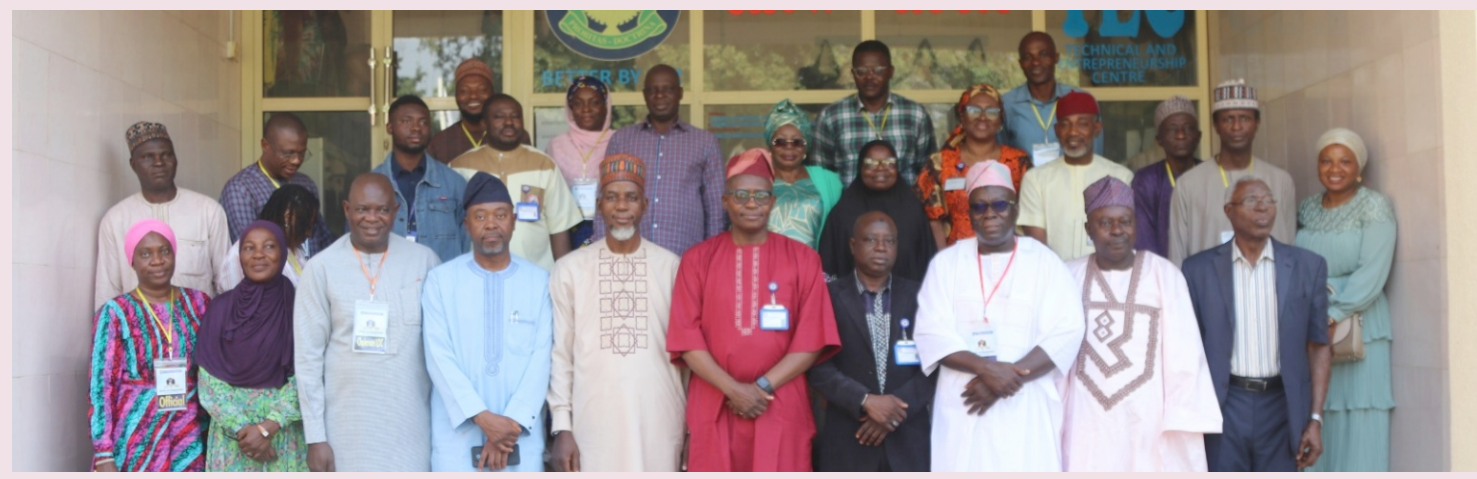
Dignitaries at the Workshop