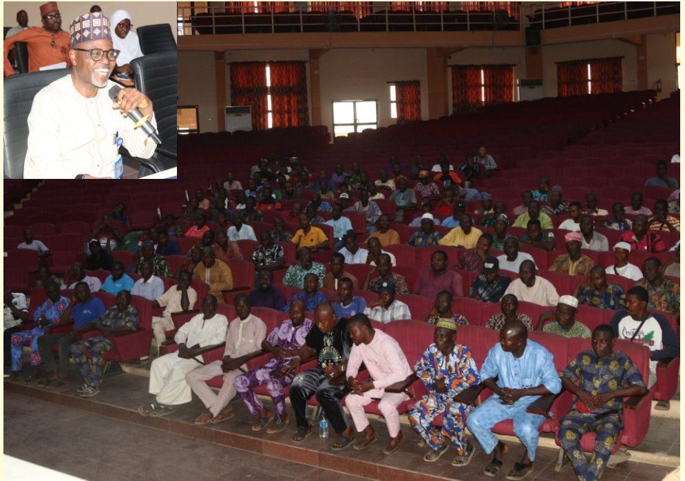
■ The Vice Chancellor (inset) addressing the commercial bus drivers

The Vice Chancellor urged the drivers to continue with their legitimate