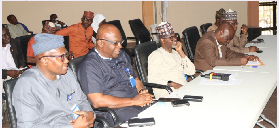
■ The Vice Chancellor and the Principal Officers at the meeting

Commenting on the digitisation and internationalisation agenda, the Senior Advocate of Nigeria mentioned the University's strides in digitisation, including a redesigned portal and the