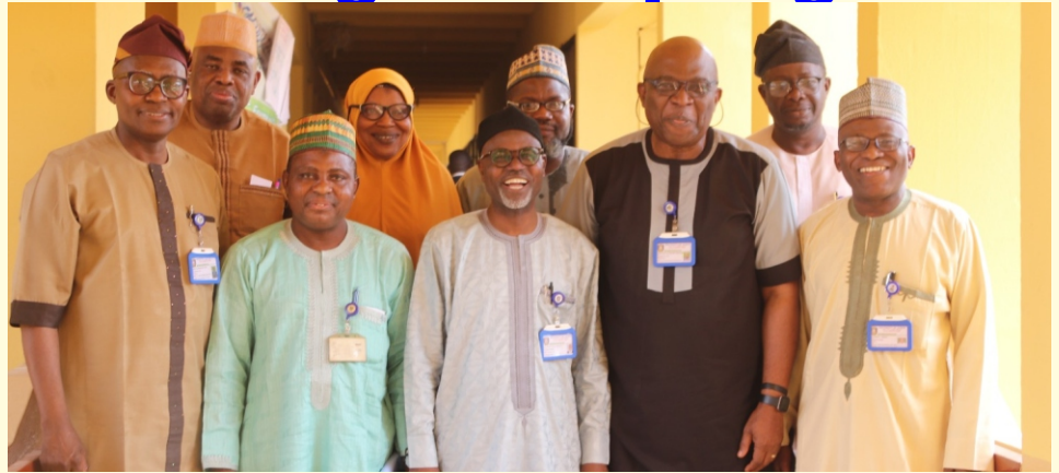
■ Dignitaries at the Workshop

participants to seize the opportunity offered by the workshop, saying that they ought to have paid for the programme because of how essential the programme will be to their academic and individual career going forward.