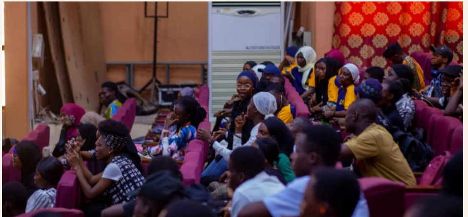
Cross section of students at the event