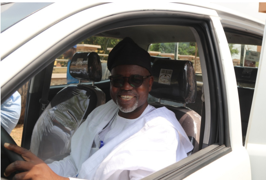
■ The Vice Chancellor test driving the Hillux van

He also noted that his company, Sovereign Campus Concept Ltd, has been engaging in various CSR activities within the University, including providing financial assistance to indigent students.