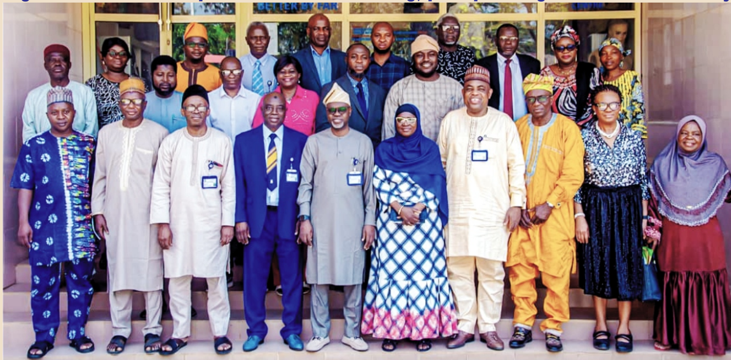
■ The Vice Chancellor and the newly promoted professors shortly after a meeting with them on their promotion