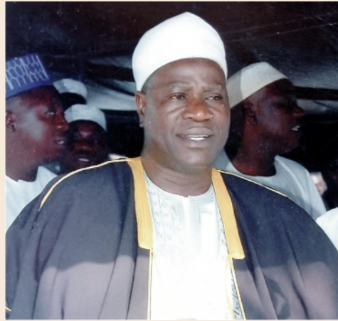
■ Oba Adeshina

While expressing belief that religion can play a vital role in shaping a better society, the royal father called for the use of religion to address Nigeria's