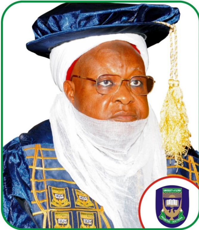
His Royal Highness Alhaji (Dr) Abdulmumin Kabir Usman, CFR Emir of Katsina & Chairman Katsina State Council of Chiefs