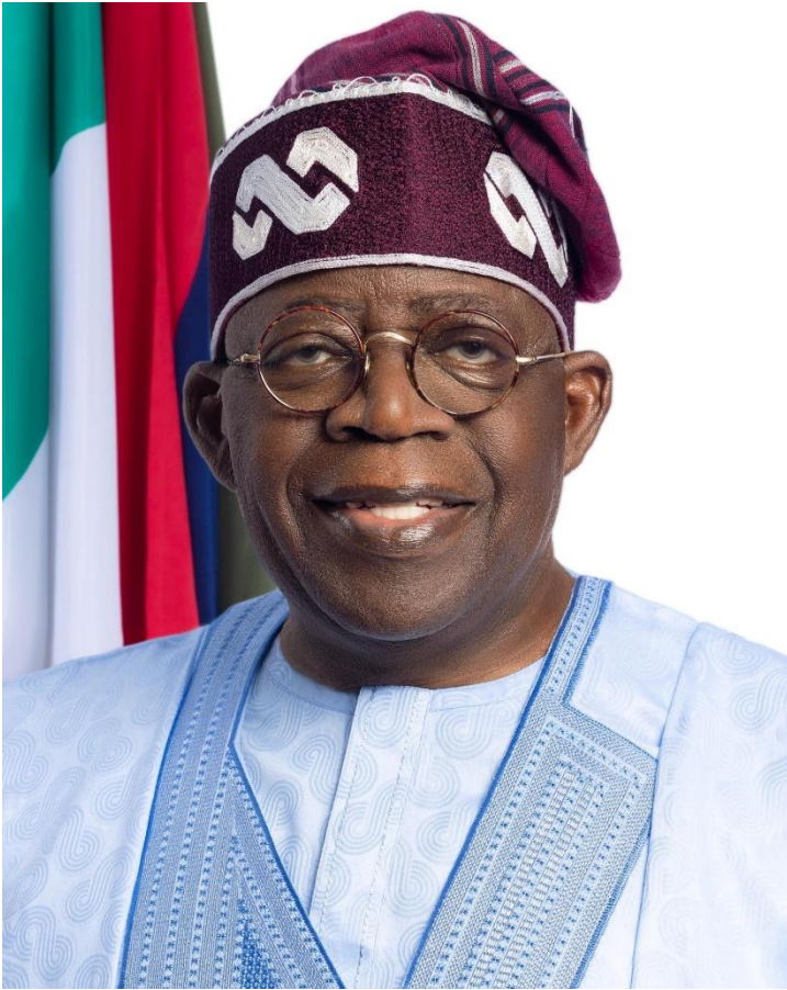
His Excellency Bola Ahmed Tinubu, GCFR President & Commander-In-Chief of the Armed Forces Federal Republic of Nigeria